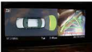
ORIGINAL SCREEN SCREEN OF REAR CAMERA(1:2)