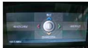
FULL OF ORIGINAL SCREEN