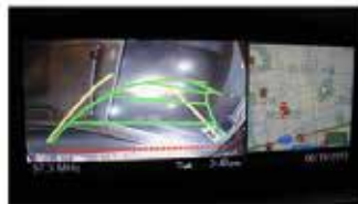
SCREEN OF REAR CAMERA(1:2) ORIGINAL SCREEN