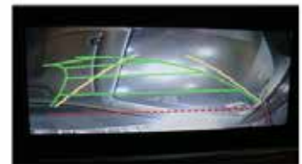
FULL SCREEN OF REAR CAMERA