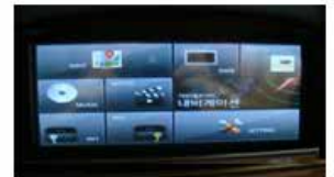
FULL OF AV SCREEN